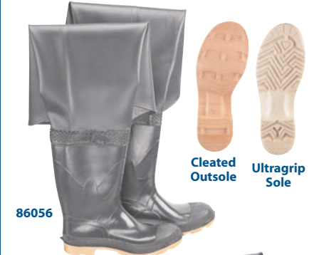
Cleated Outsole Ultragrip Sole