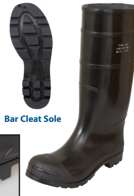
Bar Cleat Sole

Provides rugged protection from wet, sloppy conditions and also resists many chemicals and acids. The self-cleaning bar cleat sole ensures secure footing and traction. The 16" Boot features a reinforced shank for good support, an inner liner for easy donning, and a removable inner sole. A toe bar increases durability, and a heel kick lug makes removal easier. Cut lines allows for trimming if a shorter boot is required. Steel toe style complies with ASTM F2413-05. Six pairs per case. Specify size when ordering.