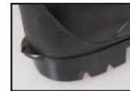
Heel Kick Lug